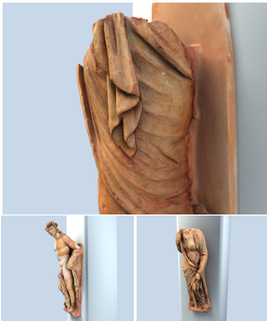
Figure 5: Three frames of the short movie generated from the digital models. All the frames comes from the sequences that shows the details on each statue

The color used in the short is the one that has been produced with the photographic mapping, as described in the previous section. Regarding the surface material representation, the rough diffuse nature of the terracotta has been well simulated using an Oren-Nayar shading. The properties of the material has been hand-tuned in order to obtain a result that closely matched. Accurate measurements of the surface response have been considered, but we found it excessive for this kind of presentation.