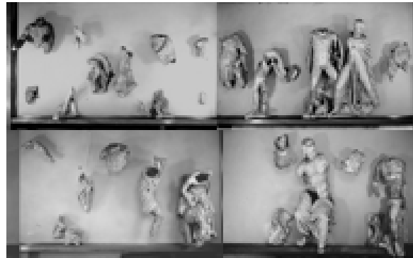
Figure 2: The "Frontone B" group of terracotta from the Luni Temple, according to the old presentation in the National Archeological Museum in Florence (status before the 1966 flood).

resolutions. Then groups of images were registered to the models [FDG*05] so that the color information could be projected on the geometry [CCCS08]. Screenshots of the post-processing work are shown in Figure 4.