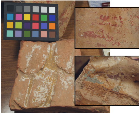
Figure 6: Main image: an example of one calibrated images of the color samples, in this case, the yellow color used for Apollon hairs. In the Insets: examples of other colors, dark male skin (upper) and grey-green used for vests and background elements(lower)

ongoing: we are trying the different measured shades of the colors and paint areas in order to better match the original color description and similar painted examples in literature. Beside this first objective of re-applying the original color, we are also trying to assess the effectiveness of the Mesh-Lab Paint interface. We hope that we will be able to improve the painting interface through the interaction with people with a cultural heritage background. Subsequently, if the first results are convincing and when a larger color palette has been obtained by measuring color remains, we will start applying a more complex shading, trying to use painted highlights and shadows in order to accentuate the geometry.