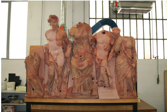
Figure 3: The five acquired statues of the “Frontone A” group, displayed in the proposed disposition hypothesis