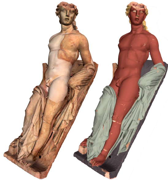
Figure 7: On left: the model of the Apollon statue with its actual color. On right: one of the first results in the reconstruction of the statue original coloring

The digital model will also enable the museum curators to build very accurate copies of the digitized objects. An interesting, but sometimes underestimated feature, is the possibility to make accurate reproduction at any scale. The full scale reconstruction will be used for the already planned placements of a copy of the second group in the original archeological location. However, also the scaled models could be