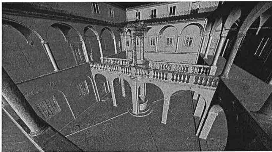
Figure 4: The 3D model of Medici's court

Not all the areas of the building have a simple geometry; on the contrary, some does present a quite peculiar shape. An example of this is the double-level cloister in the proximity of the Medici's Residence. The cloister, visible in Figure 4, has a higher level with lots of decoration and rich frescos, and a central well in the middle of a bridge, which is actually only a hole that is aligned with a proper well, placed on the lower, less decorated level.