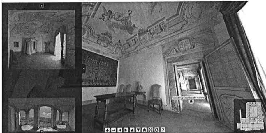
Figure 3: A different ways to see a virtual tour of Carthusian Monastery

The database respects international archival and information standards in order to be interoperable with other existing and future systems.