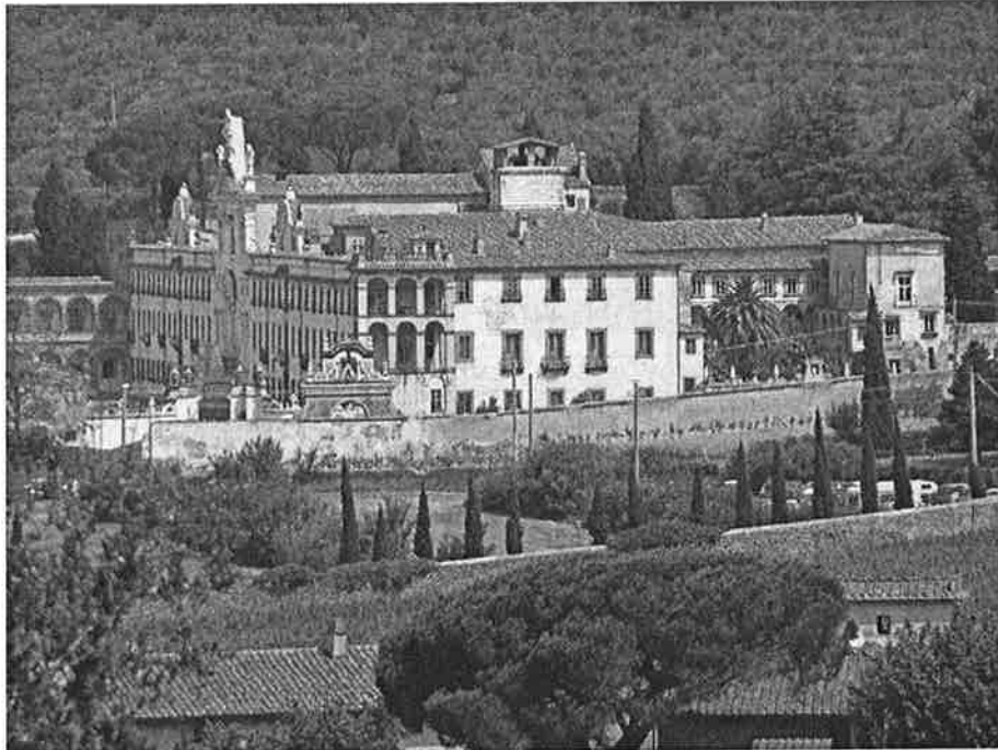
Figure 1: A view of the Carthusian Monastery