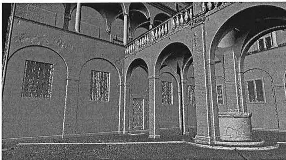
Figure 5: A particular of the decay of the Medici's court in 3D model