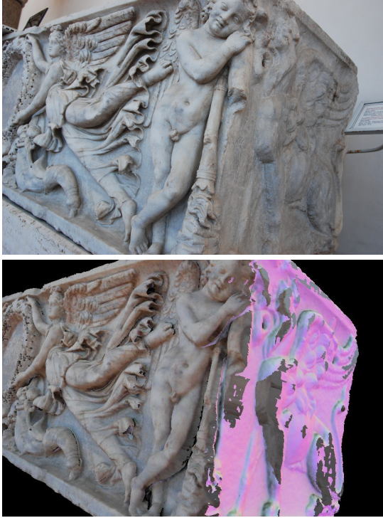
Fig. 1. An example of the images used to calculate the value of an arc. Top, the original image. Bottom: a rendering of another image projected on the top image plane. The parts which are not covered by the image are shown using a "combined" (normal map + ambient occlusion) rendering.

The proposed method aims at extending the single image registration problem to a group of images. Instead of using a pure rendering of the 3D model, the goal is to take advantage of the overlaps among the projections of the images on the surface of the model. In this way, the best alignment will be reached when all the images will project the same color details on the same part of the surface.