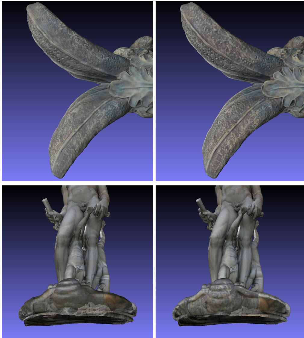
Fig. 7. Snapshots of the color projection before and after refinement. First two rows: a detail of the Gargoyle, before and after refinement. Last two rows: the bottom part of the Neptune, before and after refinement.