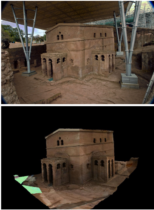
Fig. 2. An example of the renderings used for the refinement of camera parameters. Top: the image associated to the node to refine. Bottom: a rendering obtained by projecting all the other images on the 3D model. The small portions not covered by images are rendered using the "combined" rendering.

of several samples. For this reason, in order to measure the variation in the camera system after a refinement step, a group of N 3D sample points X = x_1, x_2, \dots, x_N is extracted from the 3D model. The average variation of cameras is calculated as: