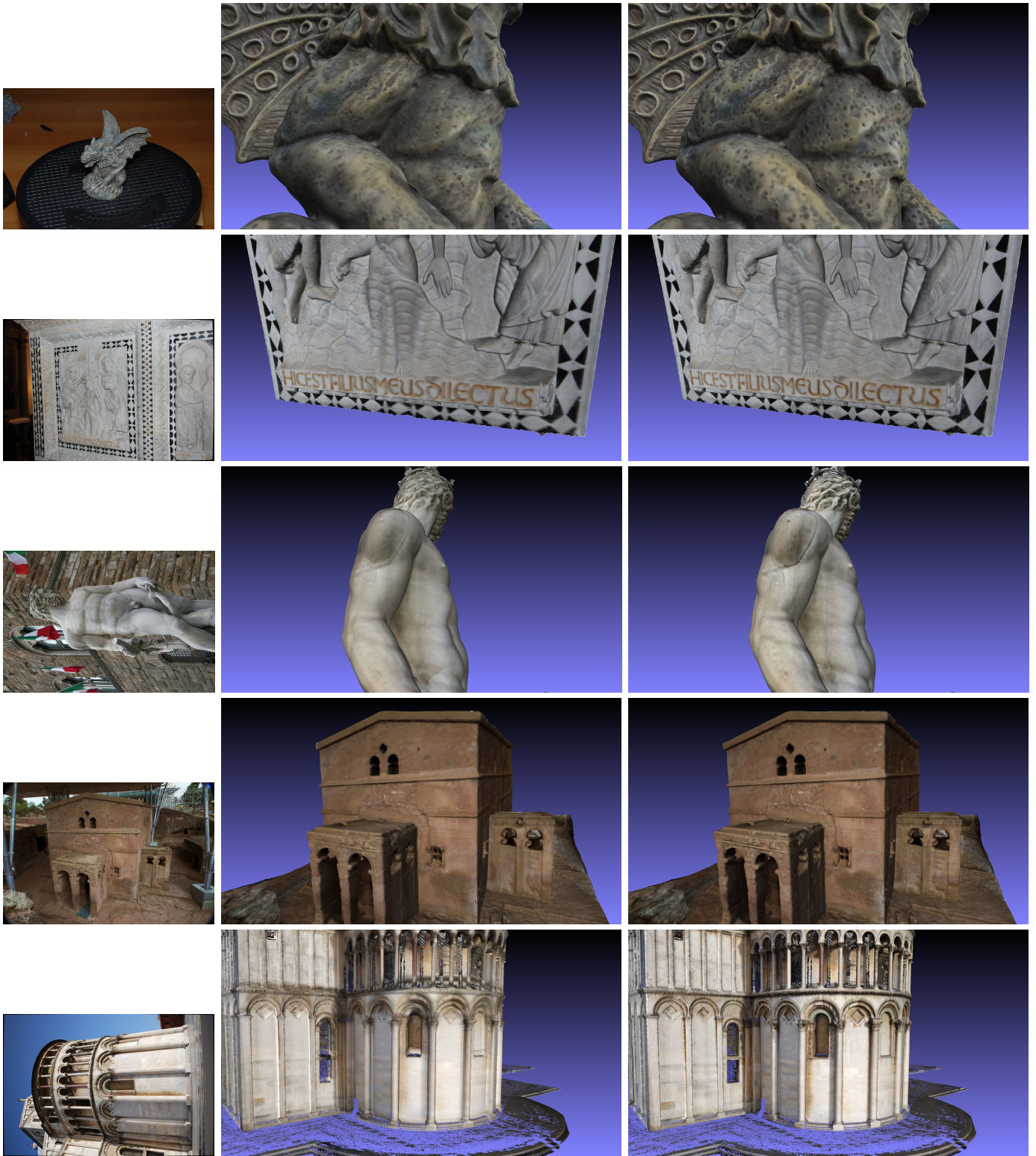
Fig. 6. The test cases. First column: a representative image of the ones used for color projection. Second column: color projection before refinement. Third column: color projection after refinement.